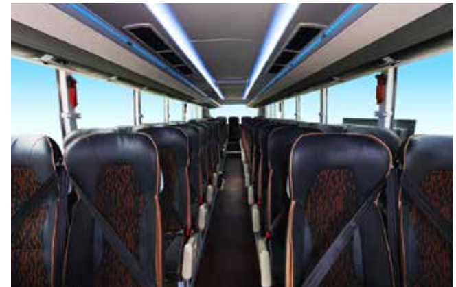
GT12 - Centre door with toilet (53+1+1)